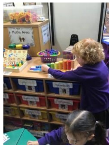
Playing and exploring