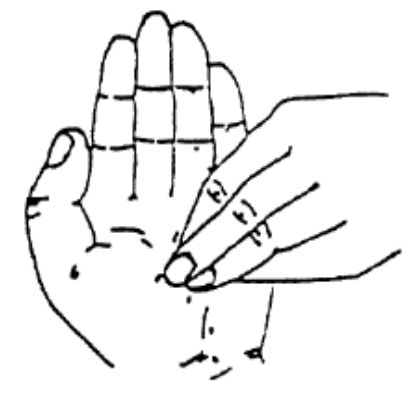
Rotational rubbing, backwards and forwards, with clasped fingers of right hand in left palm and vice versa