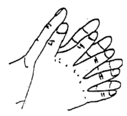
3. Palm to palm fingers interlaced